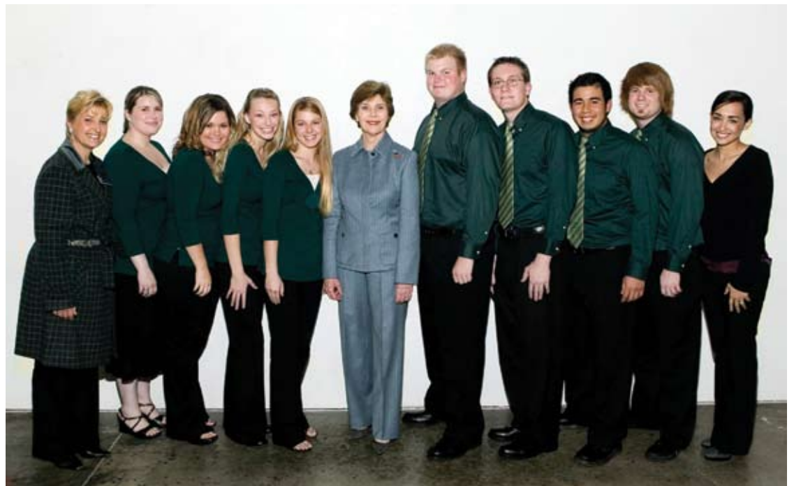
Mrs. Bush poses with student performers following the rally.