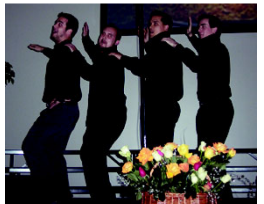
Music and Worship students perform Fall Concert in November.